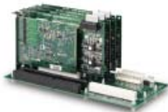
SSI bus cable for multiple cards synchronization